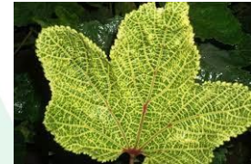
Yellow mosaic virus