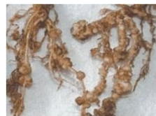
Root Knot Nematode